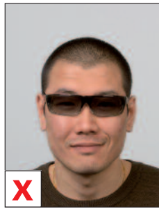
B. Tinted lens