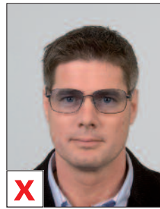
C. Tinted lens