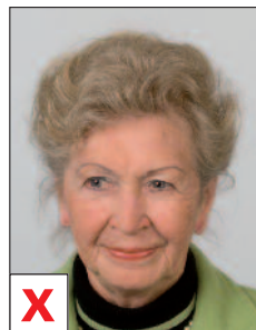
C. Not looking straight at the camera