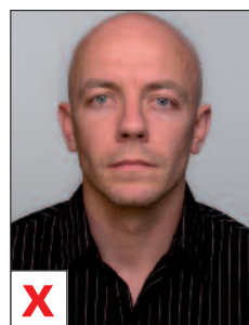
C. Head too high