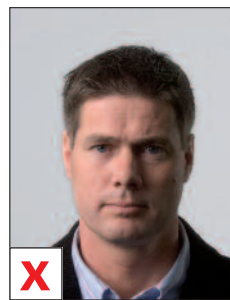
C. Shadow in face