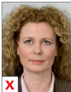
B. Not looking straight at the camera