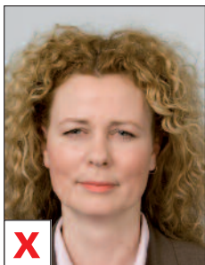
A. Not a neutral expression