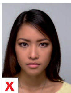
A. Not centred