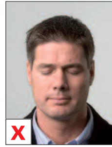
E. Eyes not visible