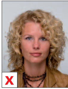
B. Face not entirely visible