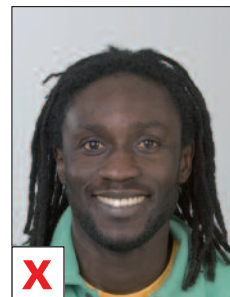
E. Mouth open