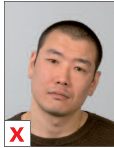
C. Head tilted to one side