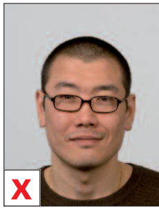
A. Eyes not entirely visible