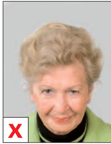
B. Head tilted