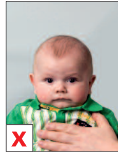
E. Visible support