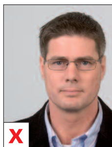
B. Not centred