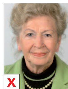
D. Head too high