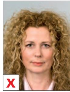
D. Face not entirely visible