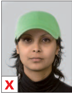
A. Head covered